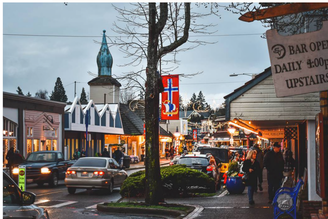
Retail facing Front Street