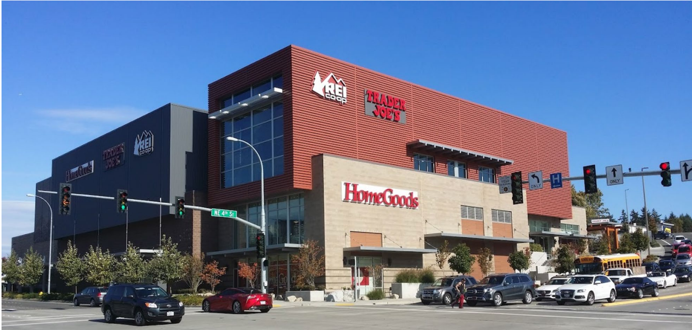
Adjacent to Infiniti of Bellevue 11815 NE 8 th St Bellevue WA, 98005